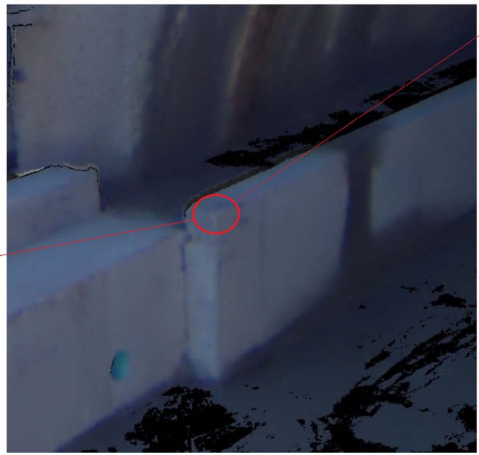
Location of x, y origin