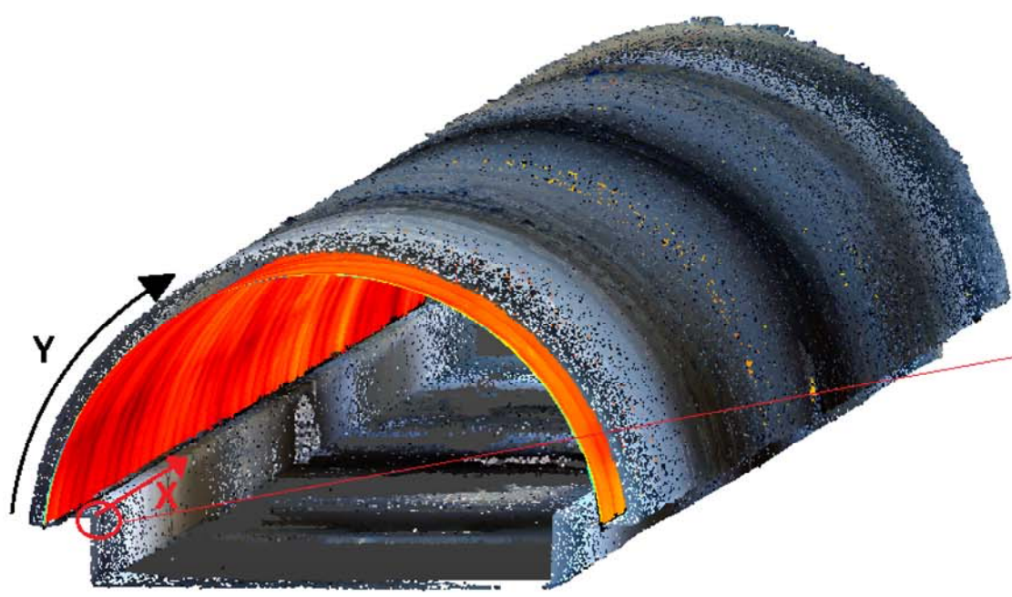
point cloud of tunnel with heat map

Measurement starts at top south corner of kneewall on the median end of the southbound lane tunnel